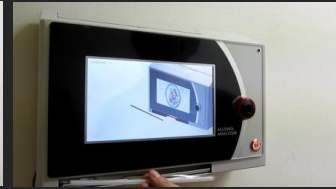
2. Take out straw