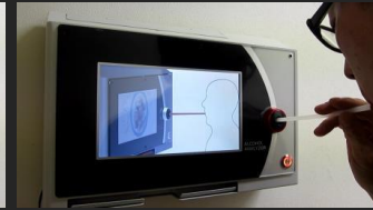
3. Blow 4s using straw