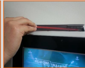
-Easy straw supplement -