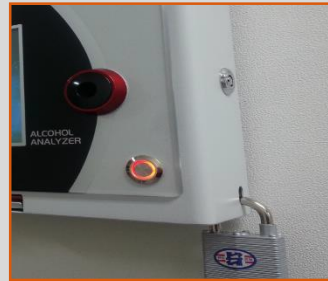
-Extra padlock install-