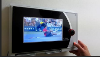
1. Press the play button