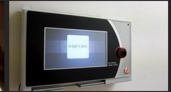
4. Result display